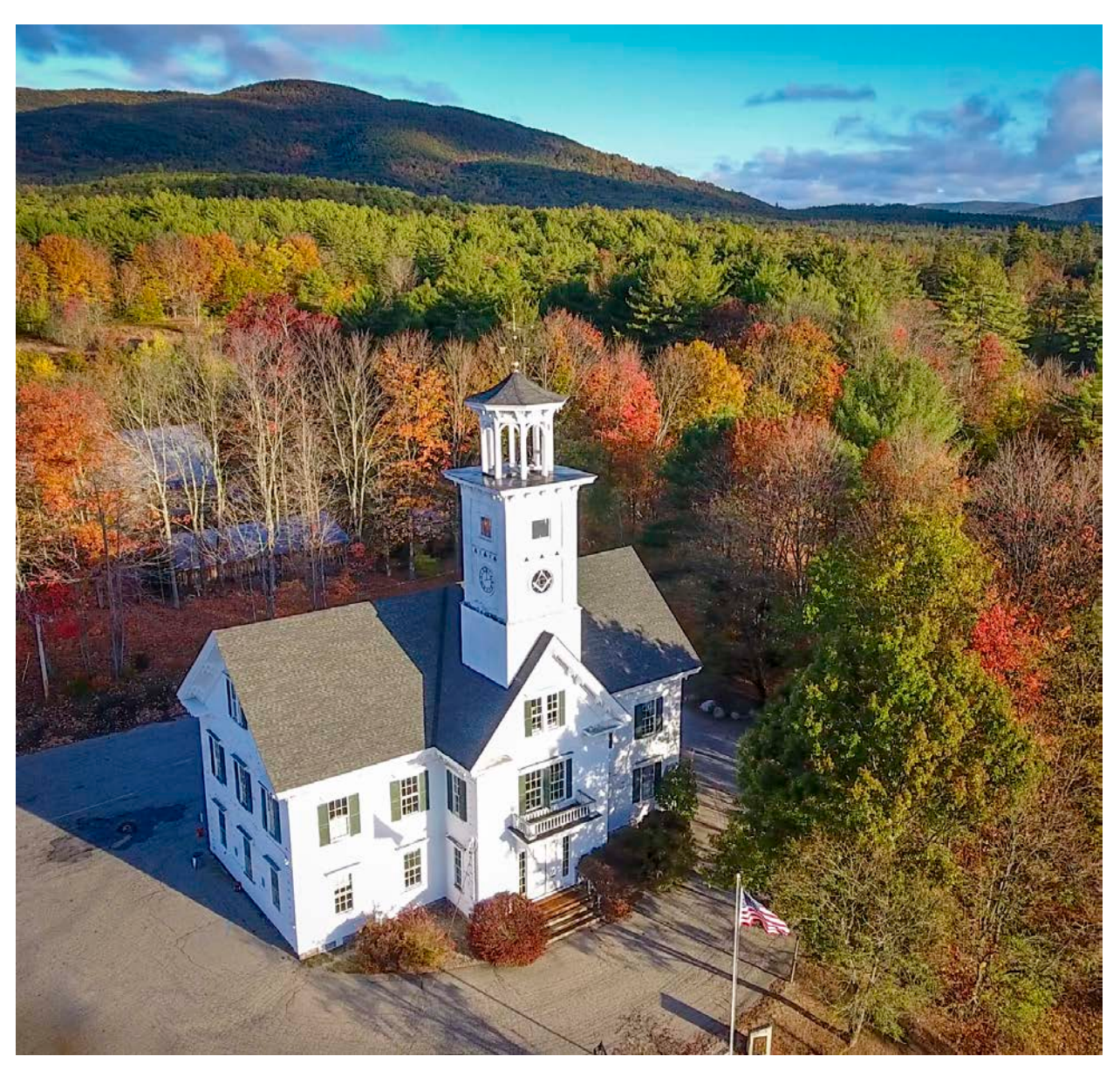
Effingham Public Library - Historic Town Hall